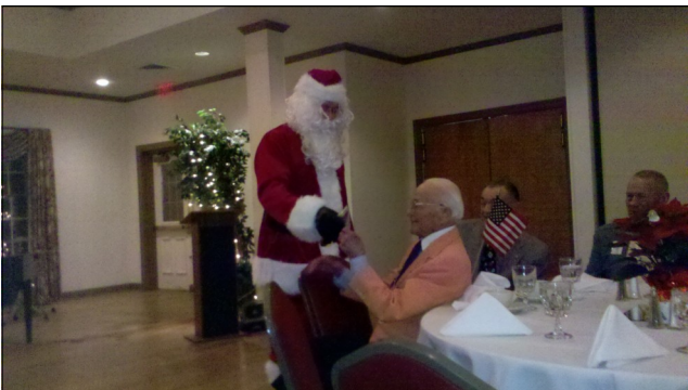
Santa even had presents for big boys...