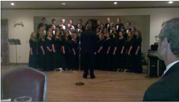
The Chambersburg Choristers provided entertainment