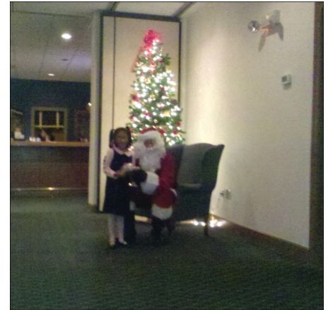
Santa had plenty of presents for the kids!