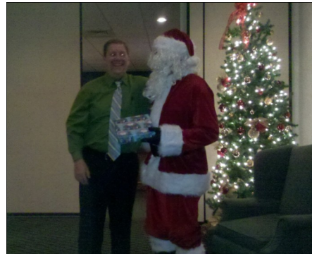
...and naughty boys!