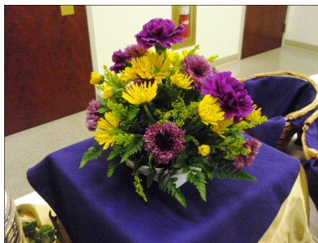
Beautiful center pieces from our local florists at Plasterer's Florist