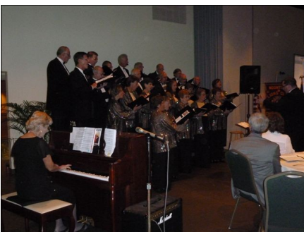
The Towne Singers